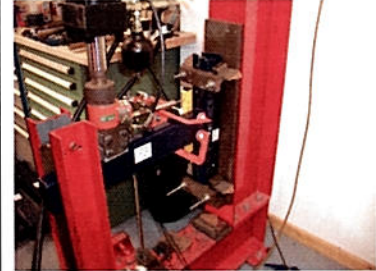
Joint Stiffness test on Beam end connector – Cowen Associates Ltd.

Using the test data, the safe working loads have been calculated based on the steel used in the tests of guaranteed physical properties. The test results and calculations carried out in accordance with the SEMA Code of Practice have been recorded in the GSR reports and are available in the Godrej Technical File for Selective Pallet Racking.