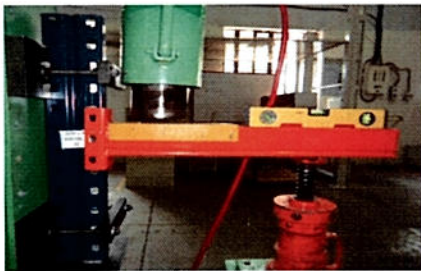
Shear capacity test on Beam end connector - Godrej.

A proportion of the tests were repeated at Cowen Associates Ltd. test facility at Shropshire - UK and at The University of Sheffield – UK.